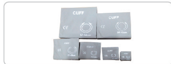
Lengthened/Adult/Children NIBP Cuff