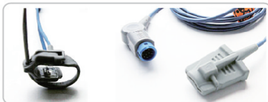
Adult/Children/Infant Spo2 Sensor