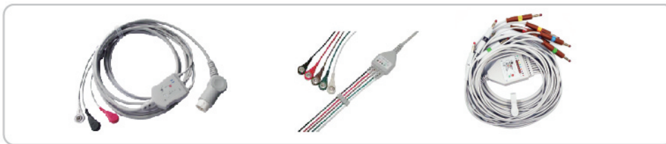
3-lead/5-lead/12-lead ECG cable